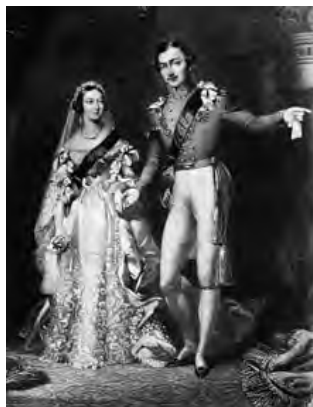
1840 (Queen Victoria)