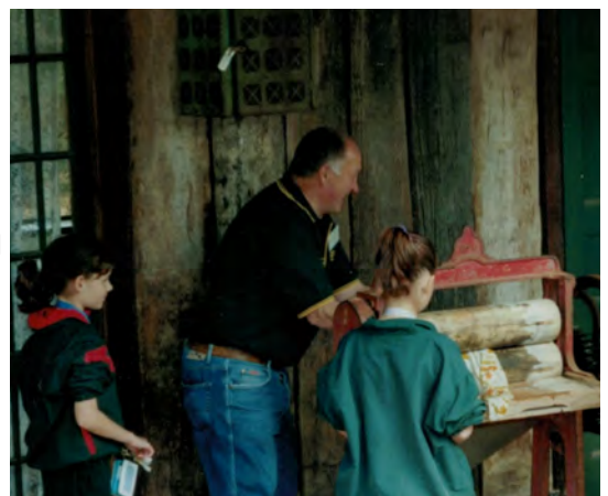
Bottom - Volunteering at The Heritage