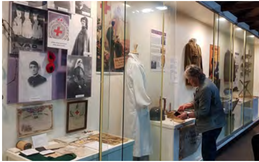
The Drill Hall exhibition 'Objects Through Time' pictured, is now almost complete and the

With this wonderful rainfall during the past month, it has introduced some new challenges to the Wollondilly area and the residents as well. Almost overnight we went from fires to floods and there has been some quite devastating effects to our roads and catchment which will see traffic interruptions for some time to come and there was significant flooding to some properties.