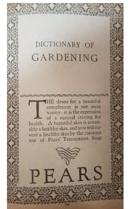
Pictured – a chapter from the Cyclopaedia