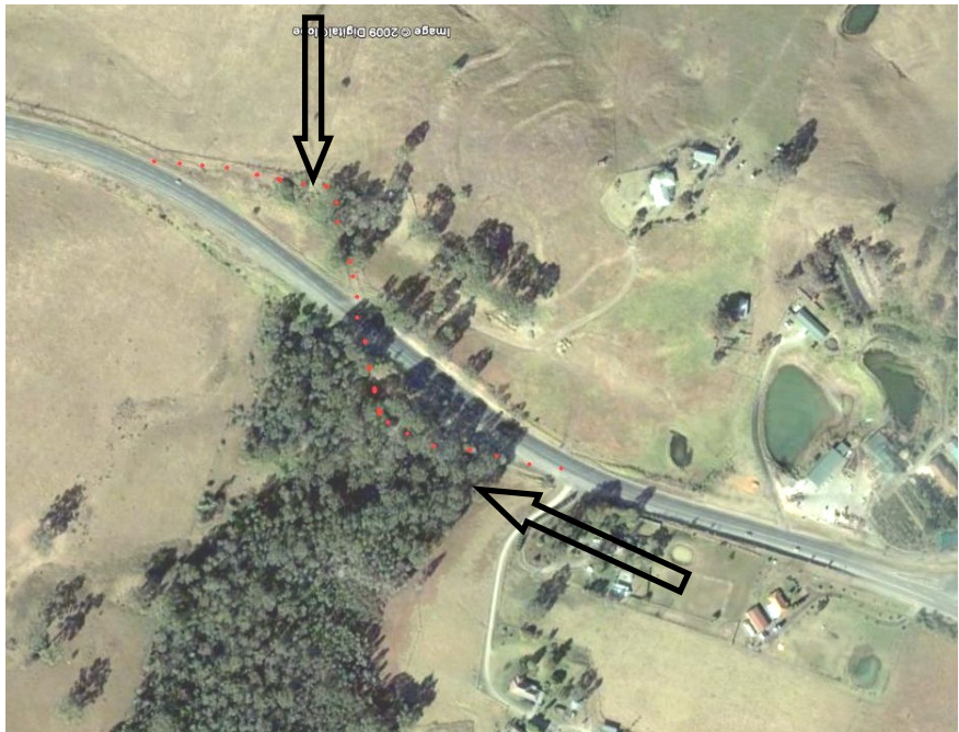
← Pictured left is an aerial view of the aligned section of Spotted Gum on Burragorang Road 2009 with the old/original road roughly shown in the red dots & arrows.