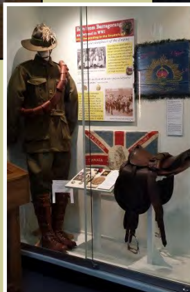
Image from the opening of the WWI display in 2014