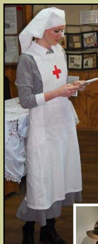
Actors, volunteers, guests and the Picton Harmony Choir