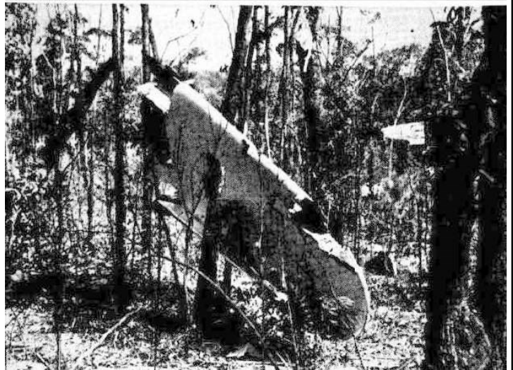
WRECKAGE OF ILL-FATED MONOPLANE NEAR CORDEAUX DAM

This is the story of the Cordeaux air disaster. The information has all come from newspapers of the day. Is there anyone around who still remembers it, or can supply any more information on it?