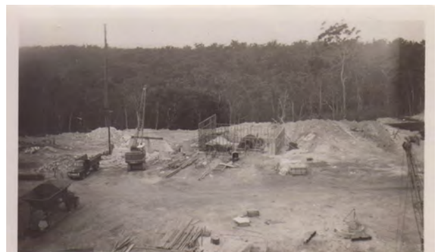
The commencement of Oakdale State Mine c1960