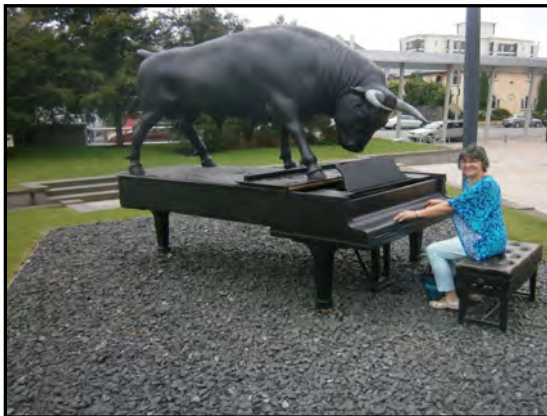
on the piano that I originally heard about at the Museums and Galleries Conference in Launceston in 2014. It became a

I have just returned from a holiday on the South Island of New Zealand. My husband had been hiking (that is trekking if you are from New Zealand) and I joined him for bit of sightseeing. There is some amazing scenery in the area as well as some sad evidence of the earthquake in Christchurch. But the people of Christchurch are moving forward and looking towards a brighter future. The Art Gallery boasts a sign across one side that says, "Everything is going to be alright". Their new building opened twelve months ago and