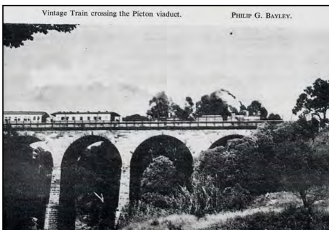
Vintage Train crossing the Picton viaduct.