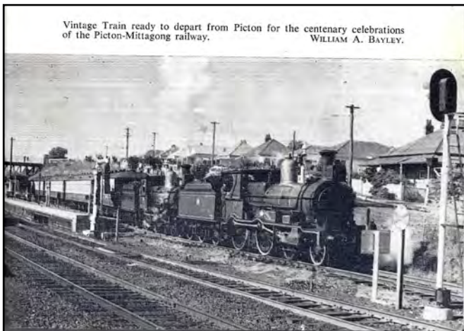
Vintage Train ready to depart from Picton for the centenary celebrations of the Picton-Mittagong railway.