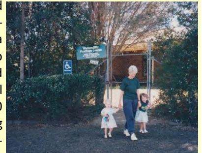
Front entry before (above) and after.

The new entry and disabled access was finished in February and a morning tea was held on 28 th April to thank all those who helped with it. The final cost of all the works was over $78,000 with the Centre only paying $1,200 of this, a truly remarkable achievement.