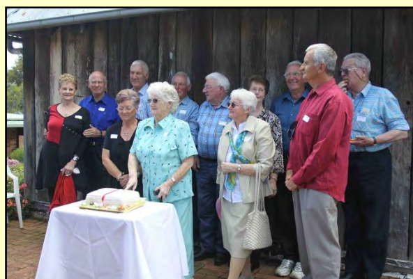
Former Barnardo's boys and their partners