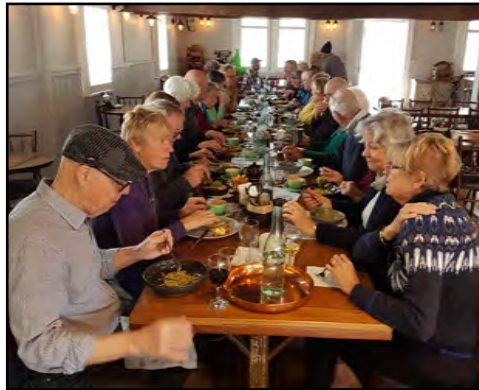
Left: Lunch at Settlers Mulgoa after our tour of The Cottage at Mulgoa