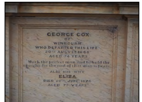
St Thomas Anglican Church and cemetery Mulgoa built 1838