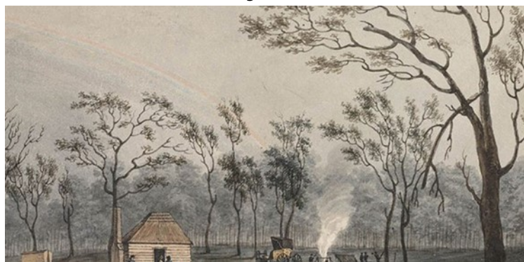
Appin Massacre Cultural Landscape

The key protection afforded by heritage listing is statutory control over change. Any major works, alterations, or development affecting a listed item needs approval from the NSW Government (usually via a heritage permit issued by the Heritage Council). This ensures that changes are carefully assessed and that the significance of the item is conserved. Demolition is strongly discouraged and, in most cases, would not be approved unless exceptional circumstances exist.